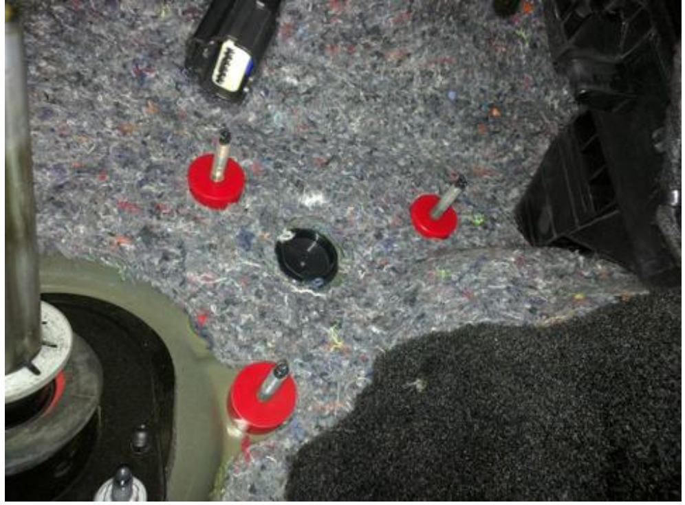
7. Add a drop of loctite to each thread